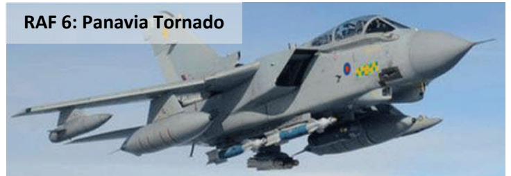
RAF 6: Panavia Tornado