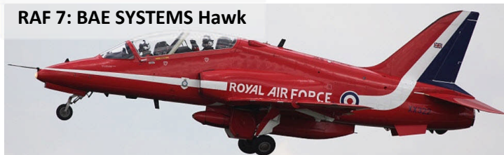
RAF 7: BAE SYSTEMS Hawk