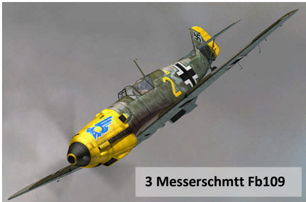
3 Messerschmitt Fw109