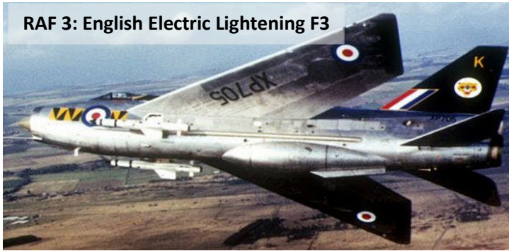
RAF 3: English Electric Lightening F3