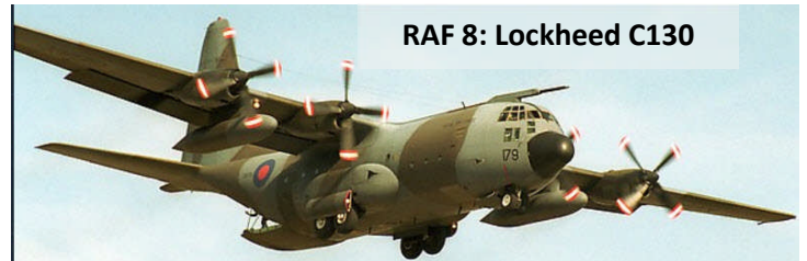
RAF 8: Lockheed C130