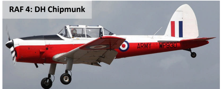
RAF 4: DH Chipmunk