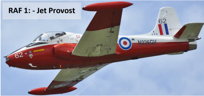
RAF 1: - Jet Provost