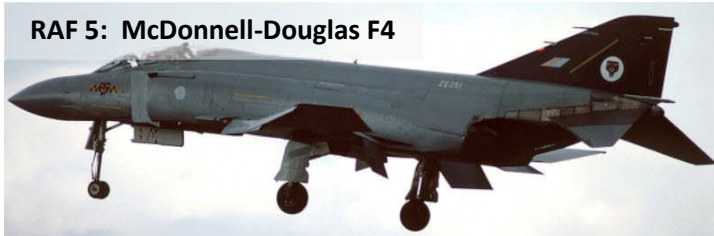
RAF 5: McDonnell-Douglas F4