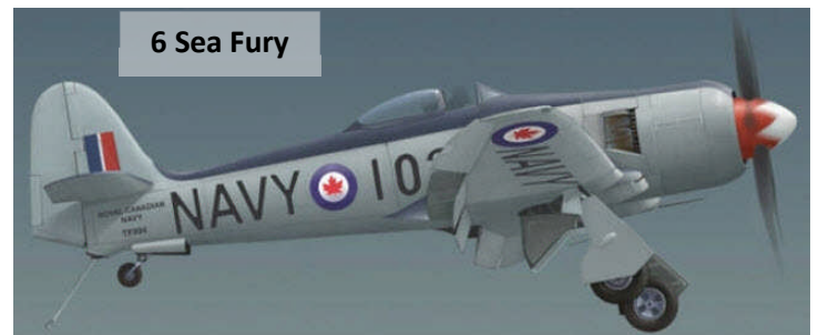
6 Sea Fury