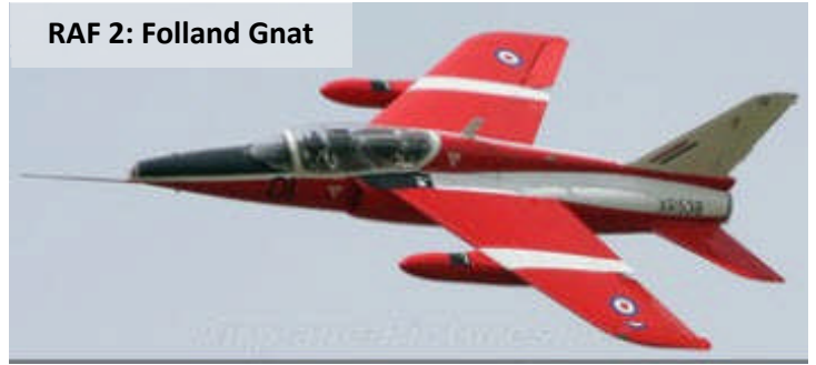
RAF 2: Folland Gnat