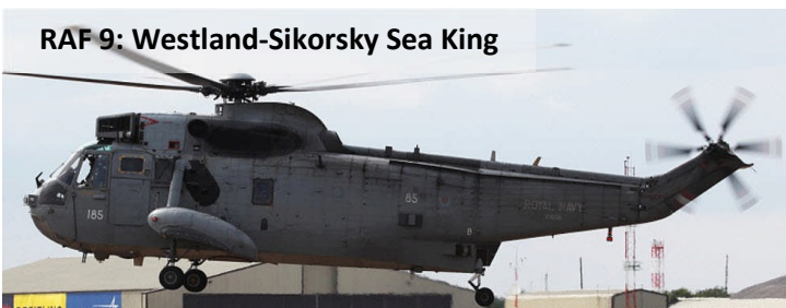
RAF 9: Westland-Sikorsky Sea King